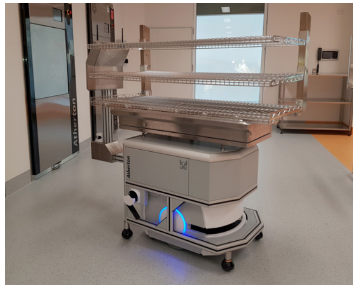
Lynx robotic automated guided vehicle robot

The CSD reception, staff offices and stair access to the theatres are also on K5E.