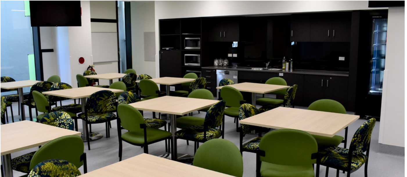
K5E staff room